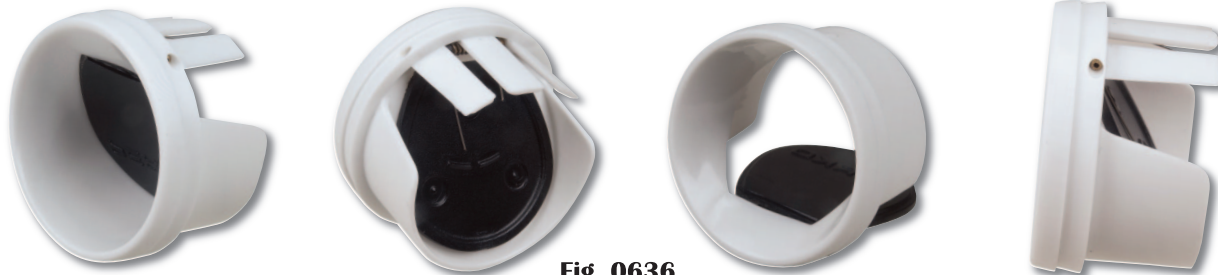
Fig. 0636 for 1-1/2" Fuel Tank Inlet Fittings